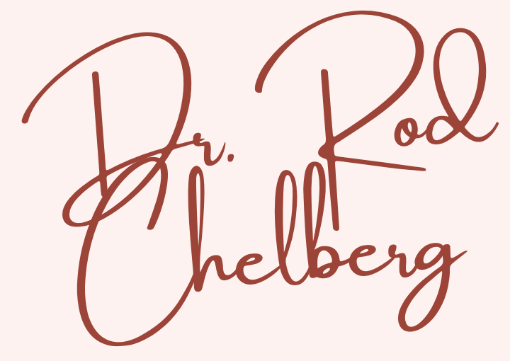
Spiritual Guide, Mentor, Teacher

Helping You Access Divine Connection for Healing